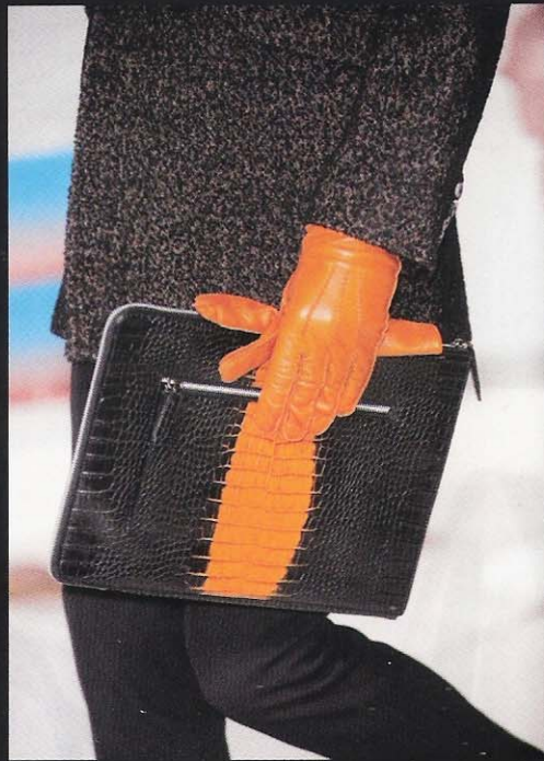
DRIES VAN NOTEN